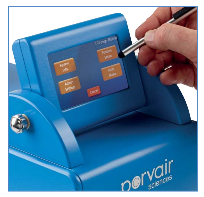
▲ All parameters can be programmed through the large colour touch screen display, using the stylus provided.