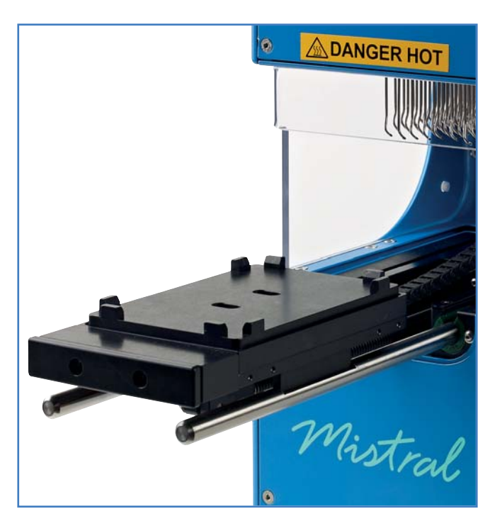
▲ An industry standard plate nest accepts all standard SLAS/ANSI footprint plates with heights up to 60mm and features positive plate detection. The extendable rails can reach up to 240mm in front of the Mistral for ease of integration with other equipment.

The evaporation table is able to rise under the control of a stepper motor as the drying process proceeds. This can be programmed at a suitable rate for each solvent type being evaporated. In addition, gas temperature, pressure and flow rate can all be programmed individually and stored in up to thirty multi-step programmes on the Ultravap Mistral controller. Each programme allows the table to rise in up to five distinct ramped phases, so that a fast initial drying period can be followed by a gentler final drying phase. The new Ultravap Mistral is usually located on the right-hand side of the robot deck. Control commands are sent directly from the robot controller to the Mistral. These standard commands are listed in the manual, but most robot manufacturers have drivers available to control the Mistral, making integration a seamless process.