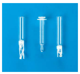
401-530, 401-531, 4015BS-529

All Glass Inserts are available Silanized.