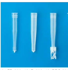
401CP-530, 401P-530, 401PBS-530