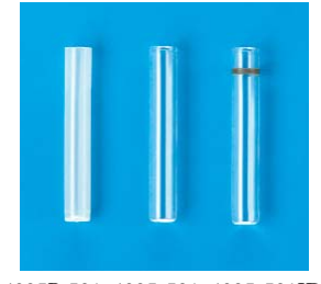
4025 P\text{-}531,\, 4025\text{-}531,\, 4025\text{-}531 \mathrm{ID}