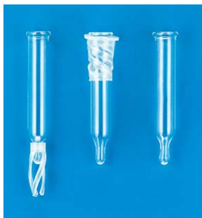
403BS-638X, 403TS-638, 403-638X