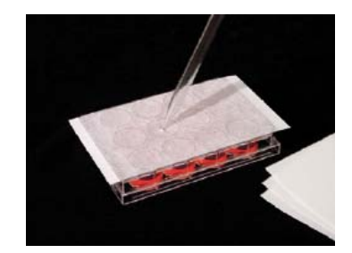
AeraSeal sealing films minimize cross-contamination, spillage and evaporation.