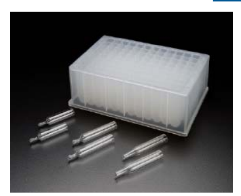
System uses 96 glass tapered inserts in a 96-square deep well plate.

An ideal solution for sample storage, reactive chemistry and biological testing.