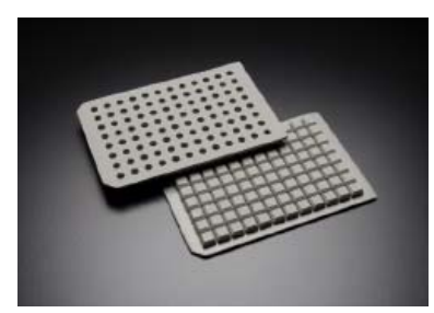
Square Well Molded Mat