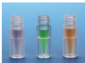
30510P-1232, 30510CP-1232, 30510T-1232