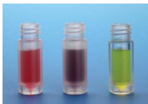
30710P-1232, 30710CP-1232, 30710T-1232