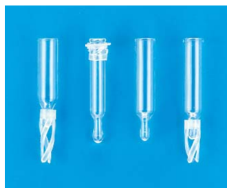
4005BS-625, 401TS-529, 4025-629, 4025BS-629

All Glass Inserts are available Silanized.