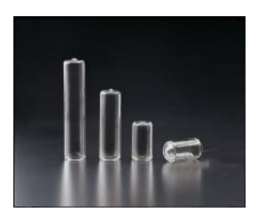
Glass Vials for Plate System

The Solid Aluminum Base Plate and the Vented Aluminum Base Plate are ideal for use with volatile solvents or for situations requiring uniform heating and cooling of samples.