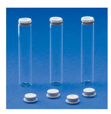
Molded individual plugs allow limited sample testing