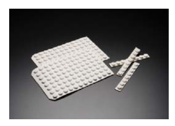
Molded mats and strips seal individual vials to isolate samples