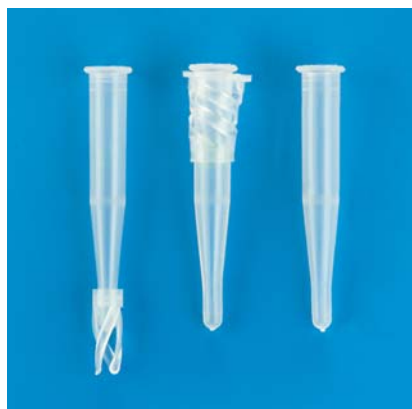
403PBS-638, 403PTS-638, 403P-638