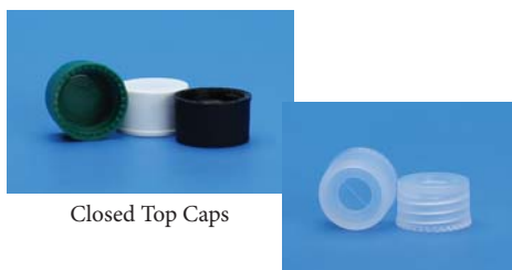
Closed Top Caps