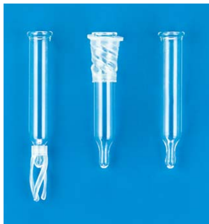
403BS-638X, 403TS-638, 403-638X

All Glass Inserts are available Silanized.