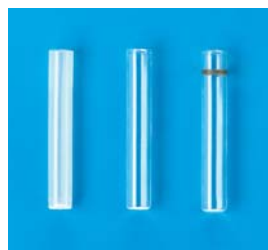
4025P-531, 4025-531, 4025-531ID