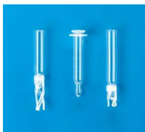
401-530, 401-531, 4015BS-529

All Glass Inserts are available Silanized.