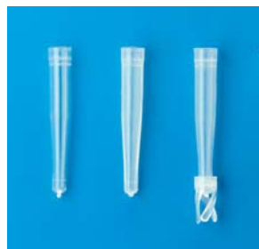
401CP-530, 401P-530, 401PBS-530