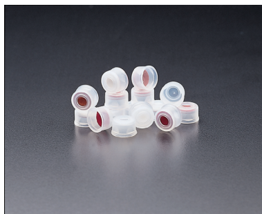
Use 8mm Precision Fit Snap Cap to seal individual vials