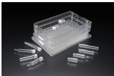
Use 8mm Precision Fit Snap Cap to seal individual vials