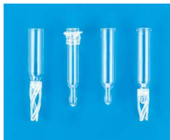
4005BS-625, 401TS-529, 4025-629, 4025BS-629

All Glass Inserts are available Silanized.