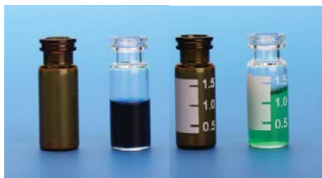
32011S-1232A, 32011S-1232, 3211SE-1232A, 32011SE-1232

Neck finish allows use of Snap Top Caps™, patented Poly Crimp™ Seals or standard aluminum seals. Snap Ring™ finish eliminates the need for crimping or decapping. Designed to work in Agilent and other autosamplers. Choose from clear or amber Type I borosilicate glass. ID design incorporates the Step Vial feature that precisely centers a limited volume insert in the vial neck. Available with graduated marking spots.