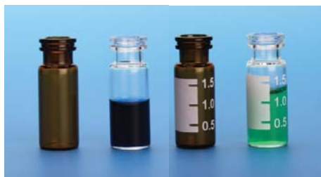
32011S-1232A, 32011S-1232, 3211SE-1232A, 32011SE-1232

Neck finish allows use of Snap Top Caps™, patented Poly Crimp™ Seals or standard aluminum seals. Snap Ring™ finish eliminates the need for crimping or decapping. Designed to work in Agilent and other autosamplers. Choose from clear or amber Type I borosilicate glass. ID design incorporates the Step Vial feature that precisely centers a limited volume insert in the vial neck. Available with graduated marking spots.