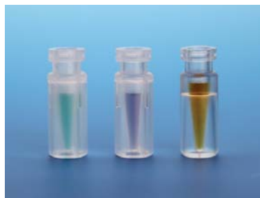
30111P-1232, 30111T-1232, 30111CP-1232