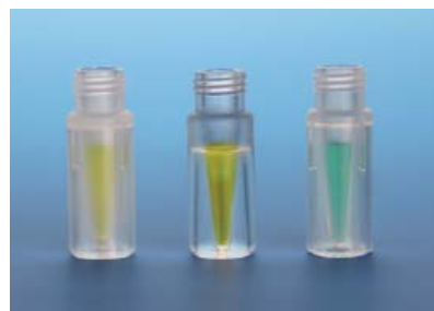
30109P*1232, 30109CP-1232, 30109T-1232