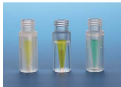
30109P*1232, 30109CP-1232, 30109T-1232