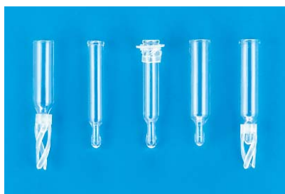
4005BS-625, 401TF-529, 401TS-529, 4025-629, 4025BS-629

All Glass Inserts are available Silanized.