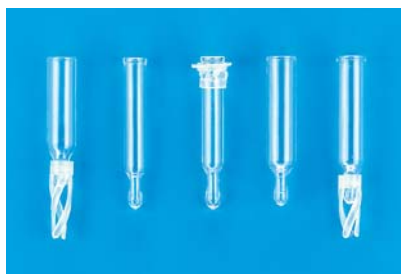
4005BS-625, 401TF-529, 401TS-529, 4025-629, 4025BS-629

All Glass Inserts are available Silanized.