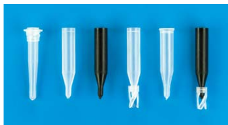
401PTS-530, 4025P-631, 4025P-631BK, 4025PBS-631, 4025PF-631, 425PBS-631BK