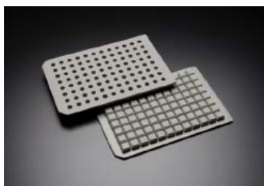
Square Well Molded Mat