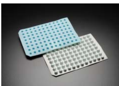
Round Well Molded Mat