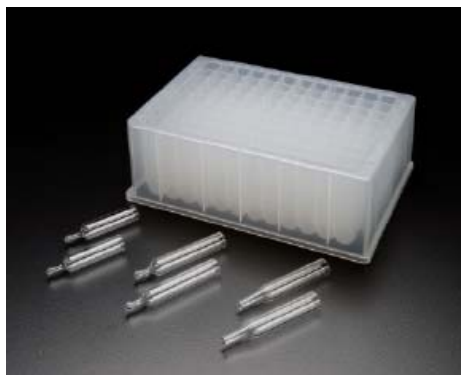
System uses 96 glass tapered inserts in a 96-square deep well plate.

An ideal solution for sample storage, reactive chemistry and biological testing.