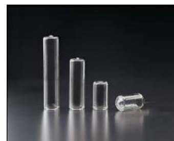
Glass Vials for Plate System