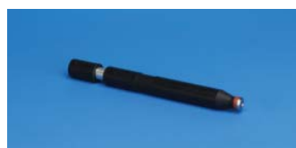
Vial Remover Tool